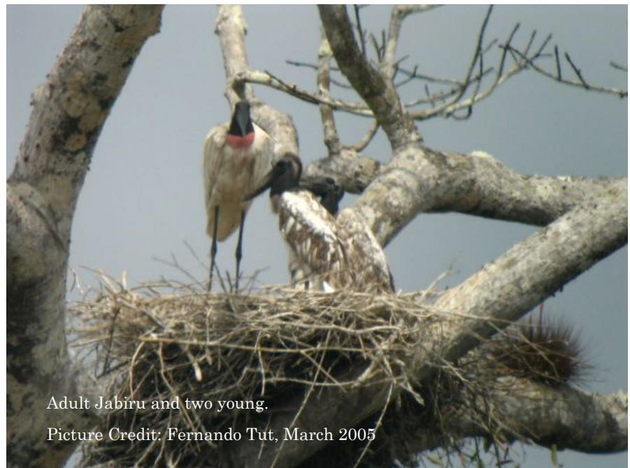
Adult Jabiru and two young.