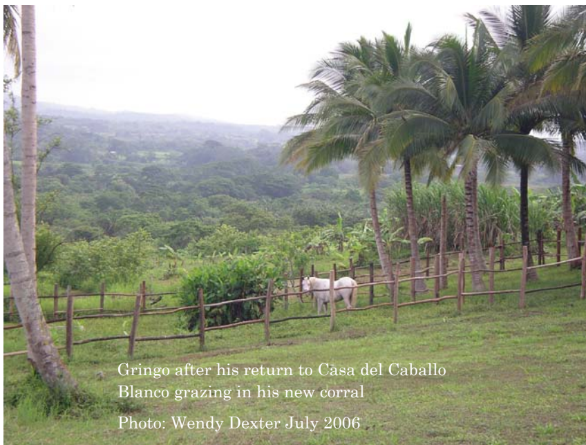
Gringo after his return to Casa del Caballo Blanco grazing in his new corral

We are proud to note that Casa del Caballo Blanco is one of two lodges listed by the Rainforest Alliance Eco-index of accommodations in Belize.