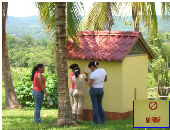
SHJC students paint No Fumar (No Smoking) signs on fuel buildings as part of internship program