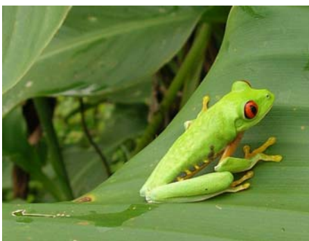
A red-eyed tree frog ( Agalychnis callidryas), observed in January 2006.