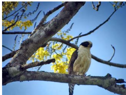
Laughing Falcon ( Herpetotheres cachinmans )

CASA's sponsors had initially envisioned the program as consisting of six like minded organizations who would participate in a coordinated effort, throughout the world, to encourage eco-travel and communication as a means to the conservation of biodiversity.